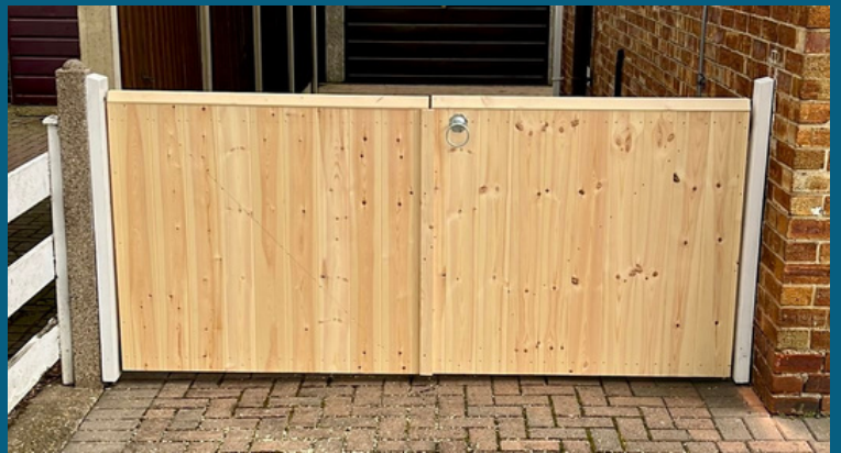
Single and double gates