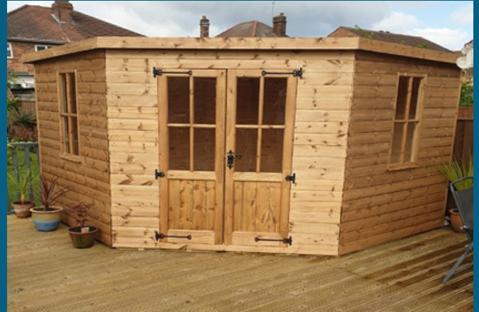
FULL LENGTH DOUBLE GLAZED