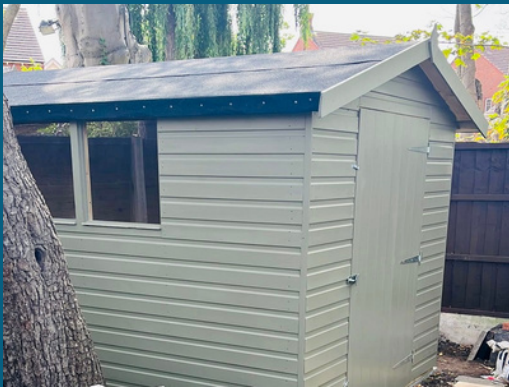
PAINTED APEX SHED