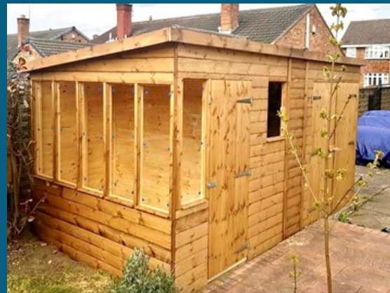
PENT POTTING SHED