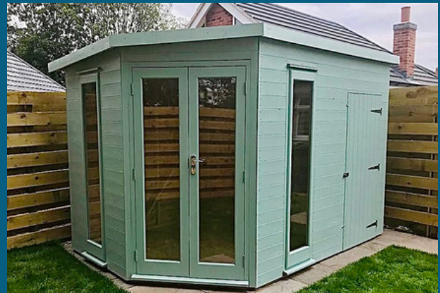
FULL LENGTH DOUBLE GLAZED