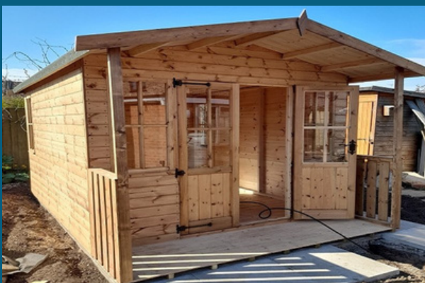
SUMMERHOUSE WITH VERANDA