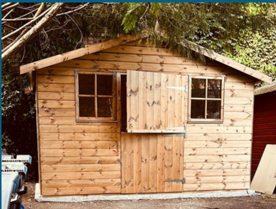
APEX SHED WITH GEORGIAN WINDOWS