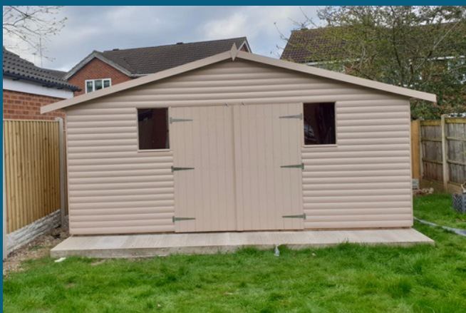
PAINTED APEX SHED IN LOG LAP