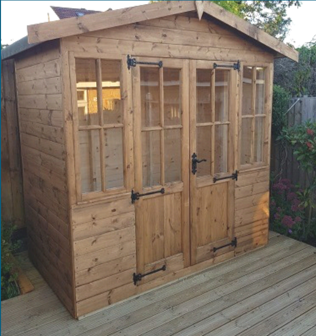
SMALL GEORGIAN SUMMERHOUSE