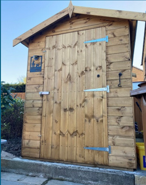
FUNCTIONAL APEX SHED