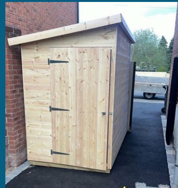
DRIVEWAY PENT SHED